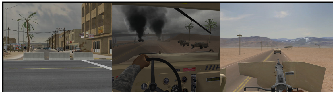
Figures 1-3. Virtual Iraq City, Desert Road and Virtual Afghanistan mountain scenes.

roof of the vehicle. The number of soldiers in the cab of the HUMVEE can also be varied as well as their capacity to become wounded during certain attack scenarios (e.g., IEDs, rooftop and bridge attacks). Both the city and HUMVEE scenarios are adjustable for time of day or night, weather conditions, nightvision, illumination and ambient sound (wind, motors, city noise, prayer call, etc.). As well, we now have created visual elements that can be selected to resemble Afghanistan scenery and architecture in an effort to broaden the relevance of the application for a wider range of SMs.